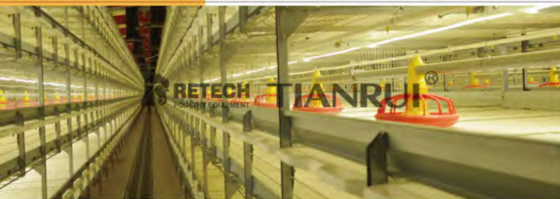
Drawing of Automatic Bird-harvesting Broiler Raising Equipment